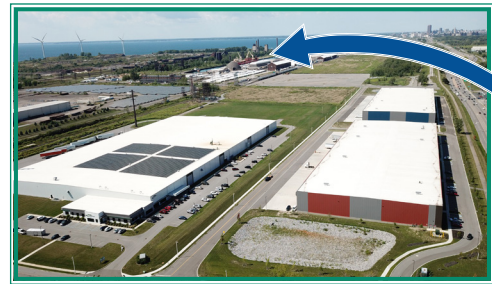
Renaissance Commerce Park